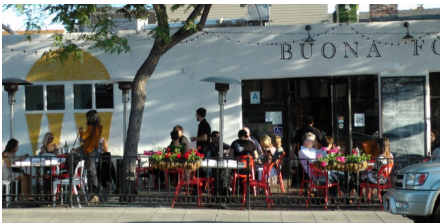
Buona Forchetta in South Park, after.

Learn about the Storefront Improvement Program by visiting the City's website at www.sandiego.gov/storefront . For more details and to obtain an application, contact the City's Storefront Improvement Program Manager at (619) 236-6460.